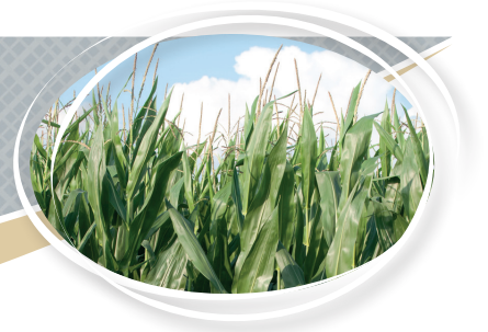
Adoption of genetically engineered crops in the U.S. (Percent of acres)